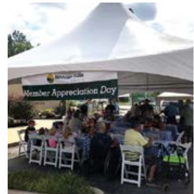
The rain held off long enough for a successful Member Appreciation Day at Jasper on September 7.